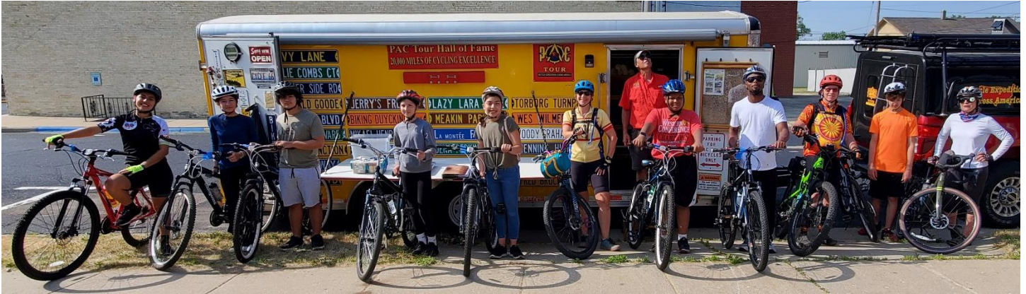
Some of the 20-mile youth riders