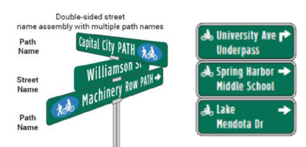
Wayfinding signage examples.

The joint effort will provide financing to purchase signage, hardware, and posts for 157 signs along the trail. The City of Janesville crews will do all the placing and installations with projected completion date spring of 2021.