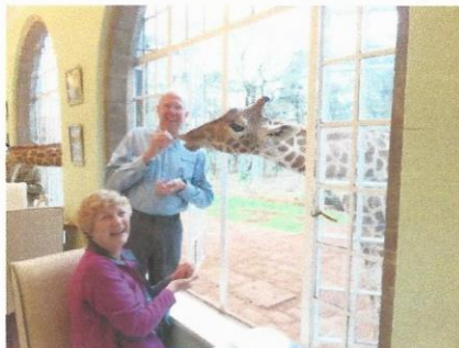
Breakfast with the Giraffes