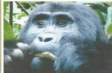
Mountain Gorilla, Uganda

See the comfort of the safari-themed accommodations and images of the Maasai culture in Kenya and Tanzania. See a mother lion nursing multiple cubs in the Serengeti and watch as a male lion approaches within inches of the open Land Cruiser. See images of great white sharks from inside a shark cage in South Africa, and much more.