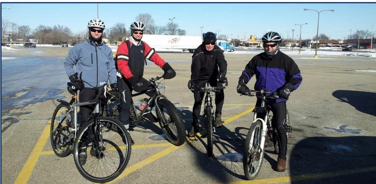
PHOTO AT LEFT: Cyclists braving the cold last year during the Frozen Fools Winter Challenge, January 1 st , 2014.