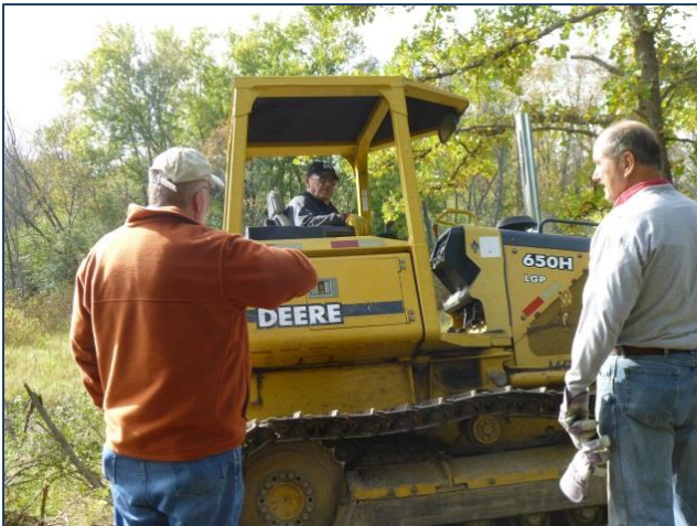
PHOTOS: Trail construction between Walters Road and Big Hill Park, September 30 th .

• Cleared and maintained existing trails within Janesville and between Janesville and Beloit.