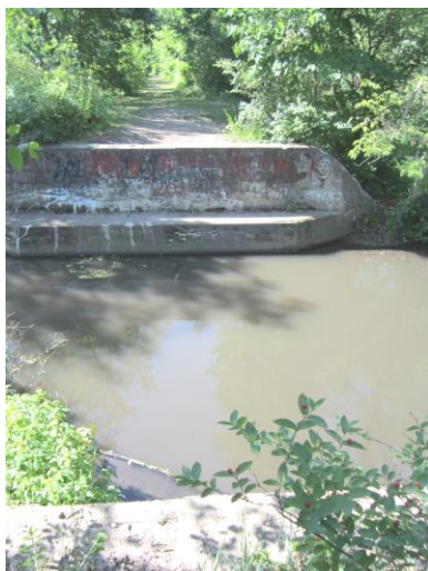
Big Hill Park bridge site looking south into the park.

Beloit Township Segment - this segment just south of Townline Road on Duggan Road goes east through grasslands to Walters Road then south to the Town of Beloit wastewater facility and follows the Rock River to Big Hill Park. The April 20 Fundraiser at the Afton Pub is to raise funds to replace the bridge into the park. The old railroad abutments still exist. The Leadership Development Academy hopes to raise $30,000 for this project.